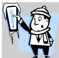
Keith can't believe it!!!

2010 was one of the coldest on record (things can only get better...right?), we recorded temperatures of below -15^{\circ} . Bet you're glad you drained down properly now, aren't you?